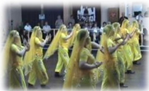
50 & Over Large Team from China