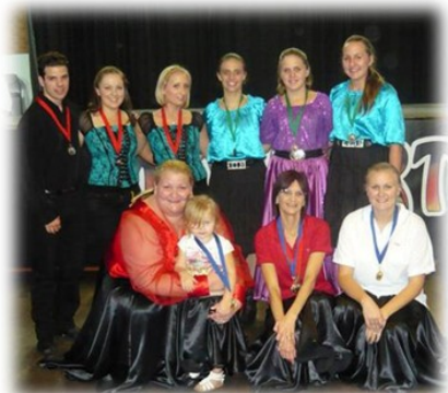
Open Trio Section Medal Presentation: 1 st Allstars, 2 nd Cowboys & Angels, 3 rd Lennox Beach Bootscooters